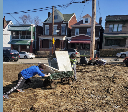
Beta Kappa Brothers helping out at the March 20 event with OPDC.