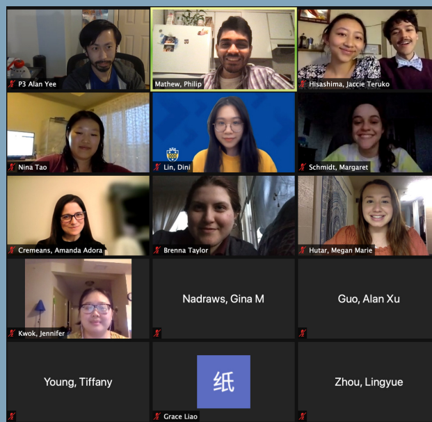
Diabetes Trivia Night!