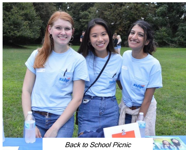
Back to School Picnic

This year, ASHP is offering free national membership to P1 students! This is a $54 value for the year and opens access to numerous educational resources and training opportunities. In conjunction with Pitt SSHP membership, members could become involved on the local, state, and national level as early as P1 year! With the ongoing pandemic, SSHP is in the process of planning a variety of virtual events for professional and academic development and are excited to share them with our members. We are looking forward to welcoming you all to SSHP this upcoming year!