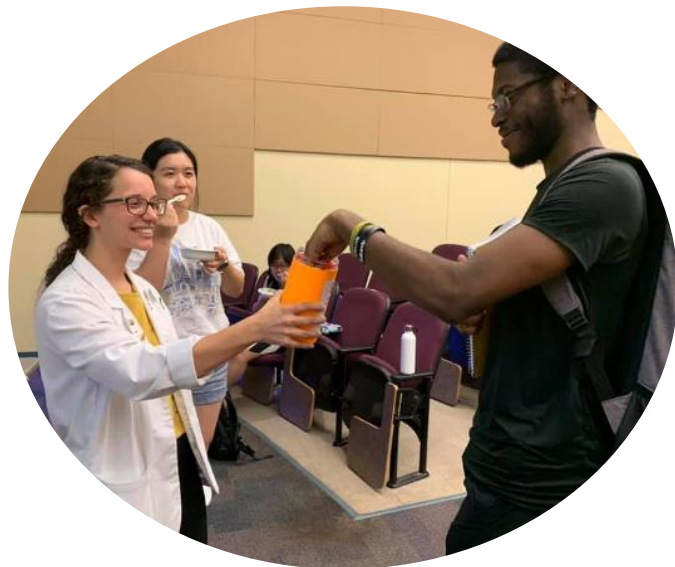
Students attended our House Prescribing (Sorting) Ceremony to determine their APhA-ASP House.

We believe that all Pitt Pharmacy students will benefit from APhA-ASP membership! If you are interested in learning more about our organization, please join us for our first General Body Meeting on Wednesday, August 26th! More details about time and location will be provided closer to the beginning of the school year. Until then, enjoy the rest of your summer and STAY SAFE!