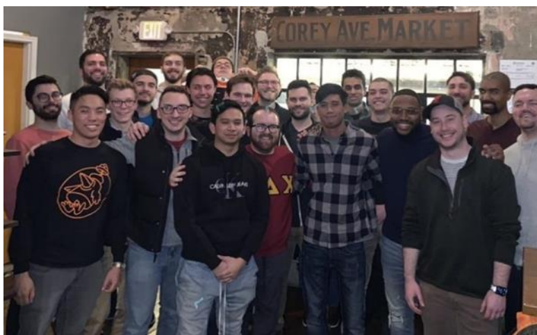
Alumni networking event with graduated brothers

We are also big fans of hosting events that bring the students of pharmacy school together to make these next four years even more enjoyable. Our biggest social event of the year is our annual formal with the lovely ladies of LKS. It is a night