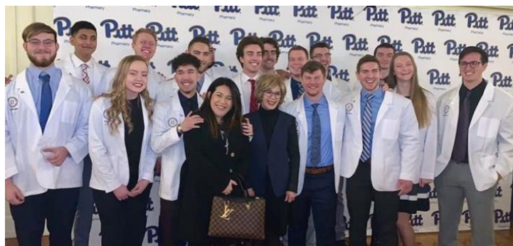
Most recent candidates to enter the chapter at their White Coat Ceremony

filled with some of the tastiest snacks and fire dance moves making it a night to remember. We have also been known to hold mixers with the PDC and LKS chapters of Duquesne. Even though our bigger events only happen a few times a year, you can always find our brothers hanging out every day. There isn't a single weekday that you won't find us eating lunch together, hanging out after classes, or participating in intramural sports together.