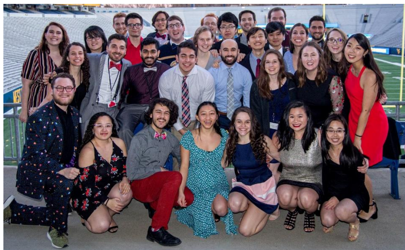
Kappa Psi brothers at the Spring 2020 Regional Assembly in Morgantown, WV