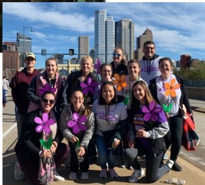
Pitt and Duquesne Chapters of ASCP at this year's Walk to End Alzheimer's Event