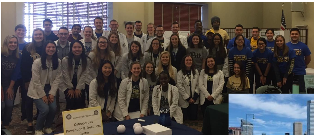
ASCP student pharmacists at Longwood Retirement Community - MLK Day of Service Health Fair

This year, ASCP will continue to host traditional events from previous years (Walk to End Alzheimer's, MLK Day of Service, Fidget Blanket Making) while also welcoming new ideas to reinvent and keep our organization on the forefront of geriatric care. Look for ASCP at the Back-To-School Picnic as we are so excited to meet you! We look forward to another great year and have so many fun events in the works! Mark your calendars for the Walk to End Alzheimer's event on September 19 th !