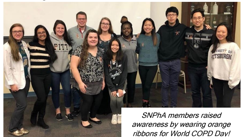
SNPhA members raised awareness by wearing orange ribbons for World COPD Day!

If you have any questions, please reach out to our executive board through our email ( snpha.pitt@gmail.com ) or through our Facebook (University of Pittsburgh SNPhA).