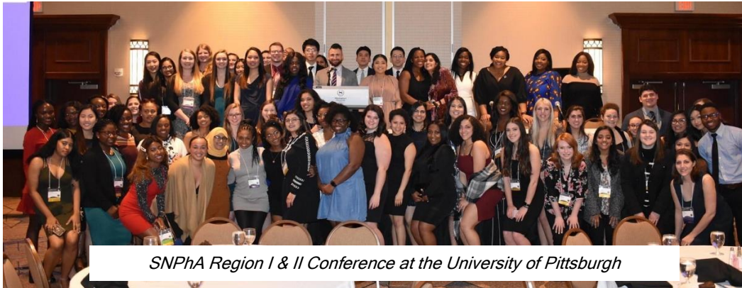
SNPhA Region I & II Conference at the University of Pittsburgh

Welcome to the Class of 2024, our SNPhA chapter is incredibly excited to meet you all! The Student National Pharmaceutical Association is an educational service association of pharmacy students who are concerned about the profession of pharmacy, healthcare issues, and the poor minority