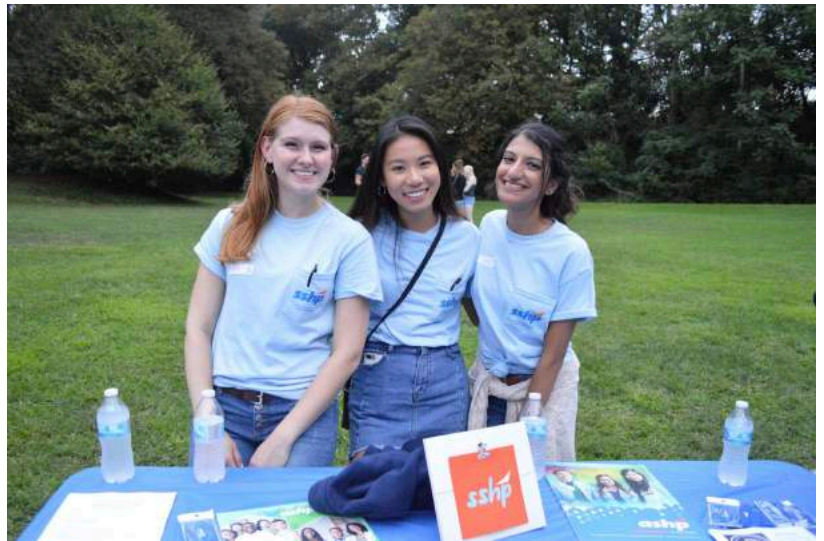
Pictured above: SSHP E-board at the Back-to-School Picnic!