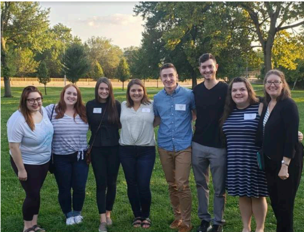
Pictured on the left: Pitt PPA members at the ACPA Picnic.

Keep an eye out for our next GBM and more information about our conference next semester if you are interested in going. The Mid-Year conference for 2020 will take place in Harrisburg, PA at the Harrisburg Hilton on January 23-26. This is a great first conference opportunity, especially for anyone who is looking for more experience with bigger events like these. Also, be sure to follow the Student Pennsylvania Pharmacists Association (SPPA) Facebook page to keep updated on what we are doing to advance the profession of pharmacy in Pennsylvania. Good luck to everyone with upcoming exams!